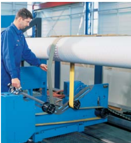
Underslung Belt Drive (BU)