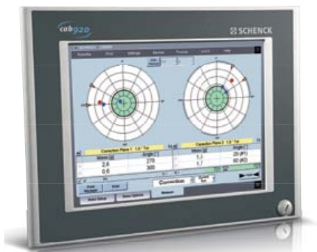
Measuring unit CAB 920