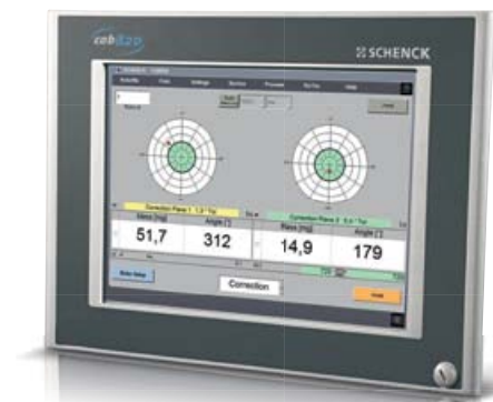
Measuring unit CAB 820

The choice of protective enclosure is determined by the danger the rotor presents, with due consideration to the balancing speed, the method of unbalance correction and the maximum penetration energy of rotor components or fragments. Depending upon the varying protection requirements, ISO 21940-23 specifies five protection classes (0, A, B, C, D) for balancing machines.