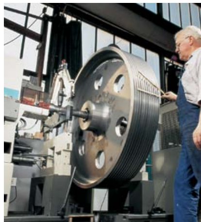
Universal-Joint Drive (U)

Selection of a drive system is determined by the shape of your rotors. Combinations of different drive systems on one machine are possible. Underslung belt drives (BU)